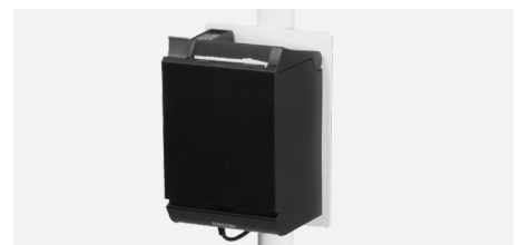
Receipt printer mounts

Fast, easy undock/redock. USB accessories connected to any Lilitab™ mount (e.g. barcode scanners, keyboard, printers) automatically connect to the tablet upon docking or redocking.