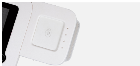
Credit card scanners