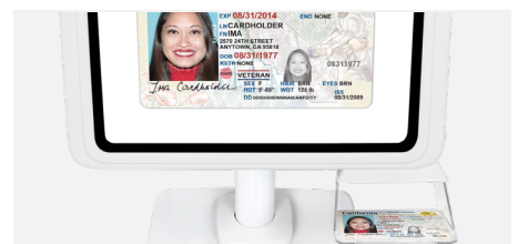
Photo ID card capture