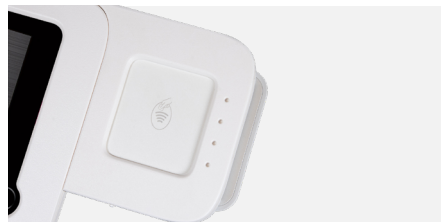
Credit card scanners