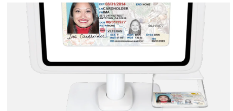
Photo ID card capture