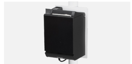
Receipt printer mounts