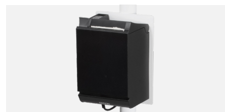
Receipt printer mounts