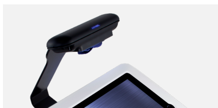
UV disinfectant lamp