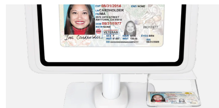
Photo ID card capture