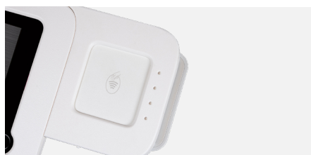
Credit card scanners