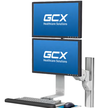
Dual monitor (stacked)