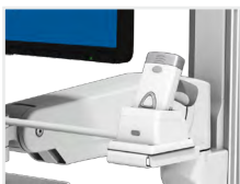
Barcode Scanner Mounts