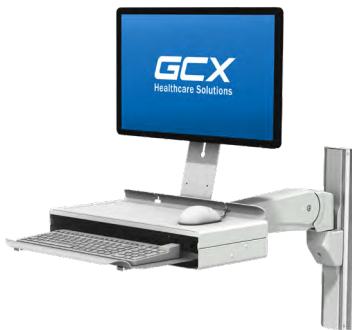
Slide-out combo keyboard tray/worksurface