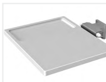
Worksurfaces and Trays