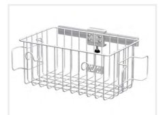
Baskets and Bins