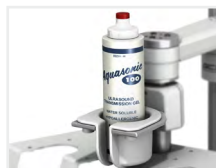
Gel Bottle/Probe Cup