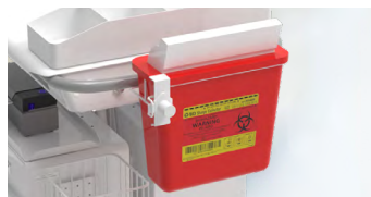
5 qt. Sharps Disposal Bin