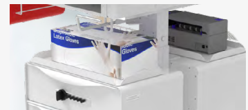
Multipurpose Cabinet-Top Trays