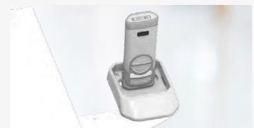
Barcode Scanner Mounts