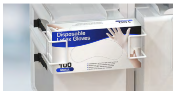
Glove box holders

Complete your custom phlebotomy solution with a wide range of device mounts, supply holders and cart accessories