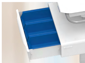
ClearView Storage drawer (for Cart)