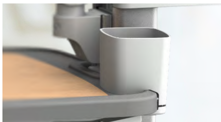
Cup Holder (for Table)