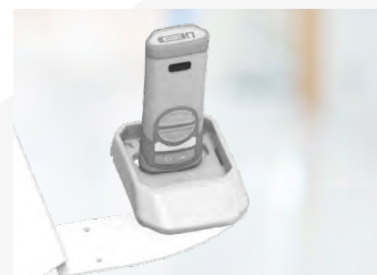
Barcode Scanner mount (for Cart)