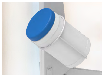
Wipes holder (for Cart)