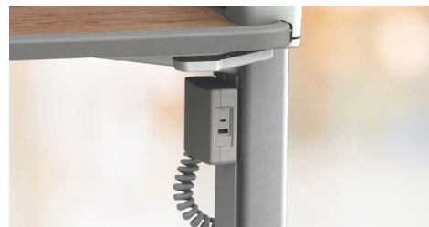
USB A/USB C Charging Port (for Roll Stand, Table)