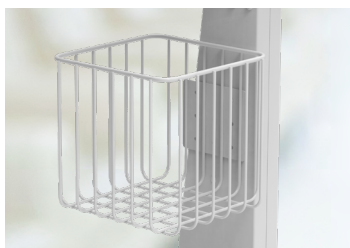
Wire baskets (for Cart, Roll Stand)