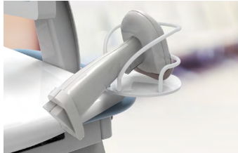
Barcode scanner holders

EVO's new design lets you mount baskets, wipes holders and other accessories closer to the front of the cart, where nurses can reach them easily.