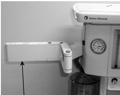
Bottom of Aespire Core Pivot Arm