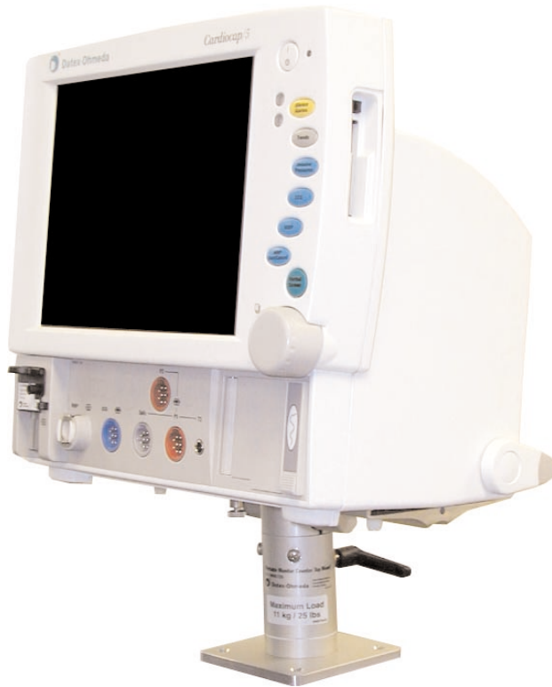
Cardiopap 5 monitor mounted on a counter top mount, P/N: 8000726. Mounting adapter supplied with monitor.