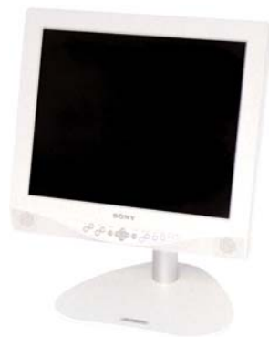
Shown with an 18" display in the landscape mode operation position.