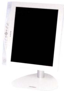
Shown with an 18" display in the portrait mode operation position.