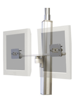
Dual Flat Panel Bracket shown on Dual Channel Ceiling Column. Available in three sizes.