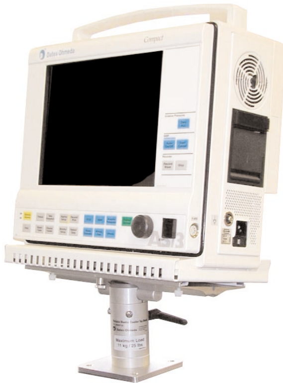
AS/3 Compact monitor mounted on a counter top mount, P/N: 8000726. Requires Datex-Ohmeda supplied mounting adapter, P/N: 887053.