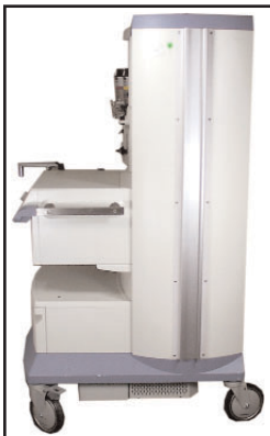
44" Right Side Channel and Adapter GCX P/N: DR-0013-14

Note: All Nov 99 and later machines have the appropriate inserts. Any previous machines require the panel kit from Dräger Medical.