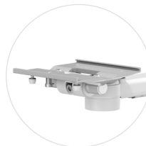
HORIZONTAL POSITIONED MOUNTING PLATE LATERAL RANGE OF MOTION