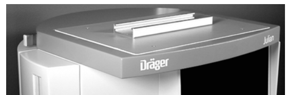
The Base Plate installed on the Julian top shelf (20" Horizontal Channel/10" bottom)