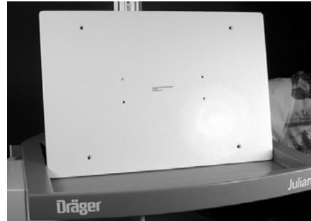
GCX Top Shelf Base Plate