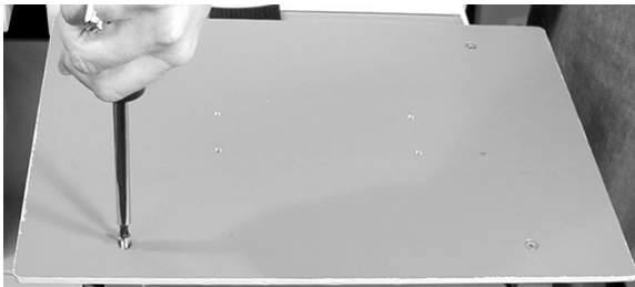
Attach Top Shelf Spacer Bars using (4) #10-32 x 3/4" FHMS