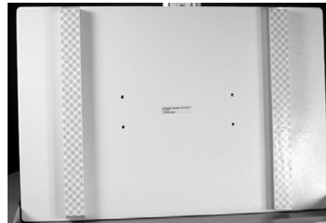
View of installed Spacer Bars. Bars have double sided VHB tape to secure to Julian top shelf.