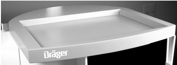
Julian Top Shelf

Note: Horizontal Channel is preinstalled.