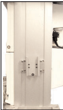
4" Channel with Dovetail Attachment Fittings GCX P/N: DX-0021-01