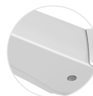
SEAMLESS, UNBODY CONSTRUCTION