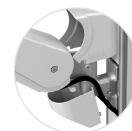
ENCLOSED CABLES AND PIVOT POINTS