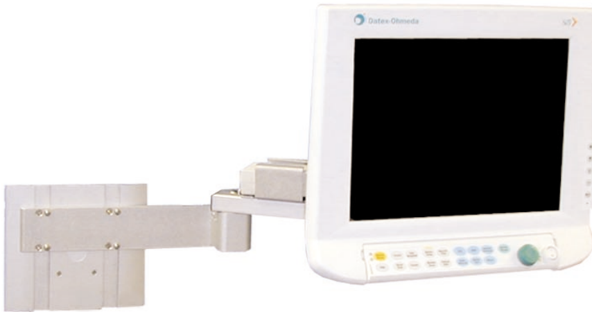
S/5 LCD display mounted on a Pivot Arm with extension bar attachment to the ADU dovetail channels, P/N: 8001702. Includes flat panel power supply holster. Also includes mounting adapters for D-LCC10 10" and D-LCC15 15" LCD display.