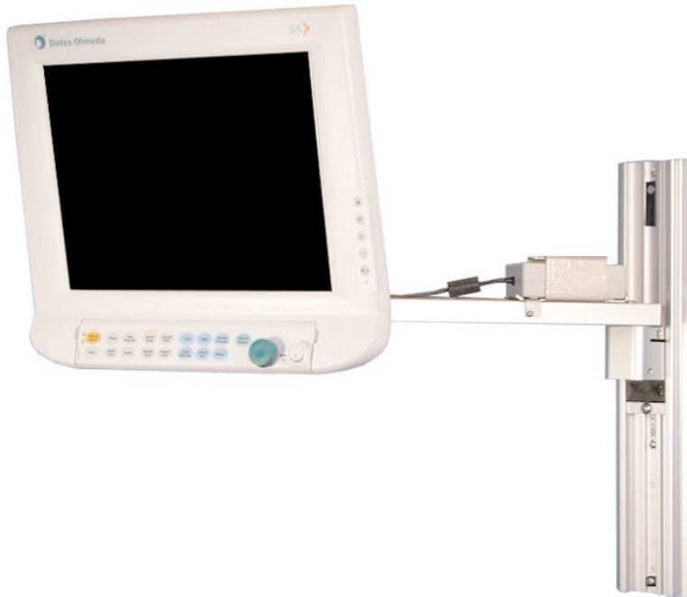
S/5 LCD display mounted on a Pivot Arm, P/N: 8001701. Includes flat panel power supply holster. Also includes mounting adapters for D-LCC10 10" and D-LCC15 15" LCD display.