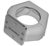
Clamping Block with Mounting Adapter